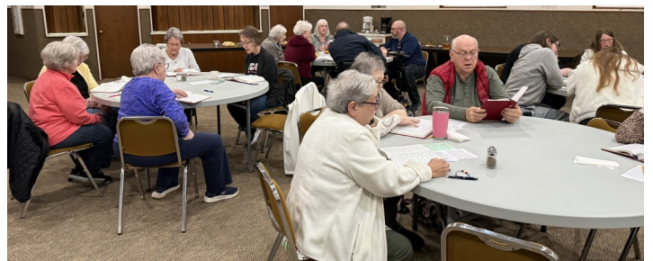
Lenten Gathering 4

Have you noticed how beautiful the church & parsonage landscaping looks. We have contracted with our lawn mowing service to complete a fertilizing schedule for the year. Also, Tammy, Pete, and Kristi are spreading Preen in the garden areas to keep the weeds down. Please enjoy our church grounds & help to keep them nice. If you see any trash on site, please feel free to pick it up & dispose of it. Thank you for your donations that allow us to maintain our landscape & thank God for our wonderful church campus.