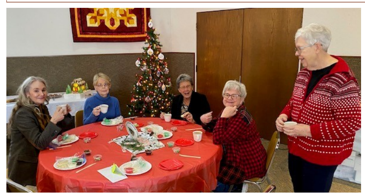
Cookie Decorating... And a wonderful time was had by all!!

Vision Statement: PILGRIM LUTHERAN CHURCH provides a warm, caring, and open atmosphere where we spread God's Word by serving our community, being a good neighbor, and embracing the power of prayer.