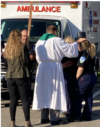
Blessing of the 1st Responders! Oct 2nd, 2022

Vision Statement: PILGRIM LUTHERAN CHURCH provides a warm, caring, and open atmosphere where we spread God's Word by serving our community, being a good neighbor, and embracing the power of prayer.