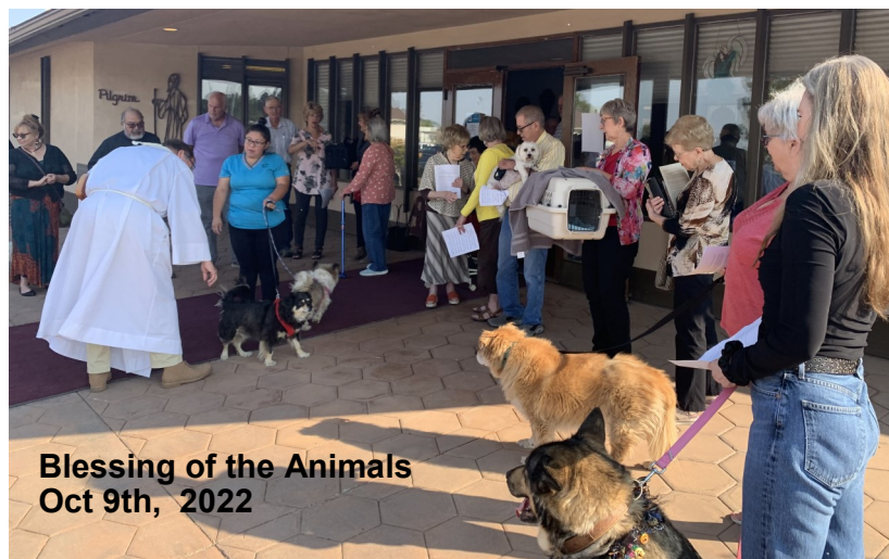
Blessing of the Animals Oct 9th, 2022