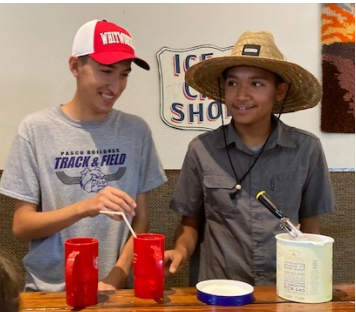
Candids from the Hat & Ice Cream Sundae Social!