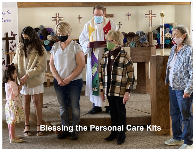
Blessing the Personal Care Kits