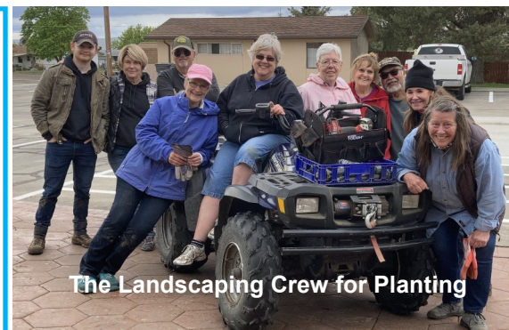
The Landscaping Crew for Planting

On the right: The planting crew for the landscaping work party April 24th. They braved inclement weather but were able to get all the large items in the ground! Many thanks to everyone who helped in the Herculean effort! More photos on the back page.