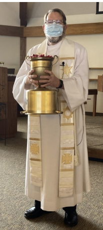
Souper Bowl Trophy Filled to the brim with chocolates!

Mission Statement: PILGRIM LUTHERAN CHURCH is led by the Holy Spirit to invite everyone to experience God's Love and Grace through life's pilgrimage of faith. Vision Statement: PILGRIM LUTHERAN CHURCH provides a warm, caring, and open atmosphere where we spread God's Word by serving our community, being a good neighbor, and embracing the power of prayer.