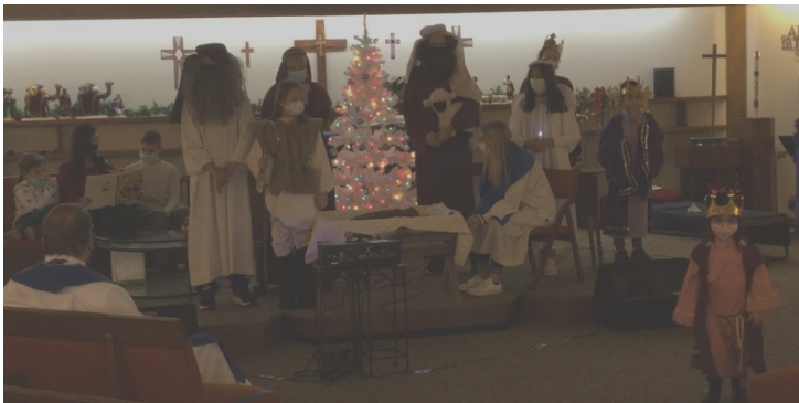
Pictured Above: Sunday School Christmas Presentation