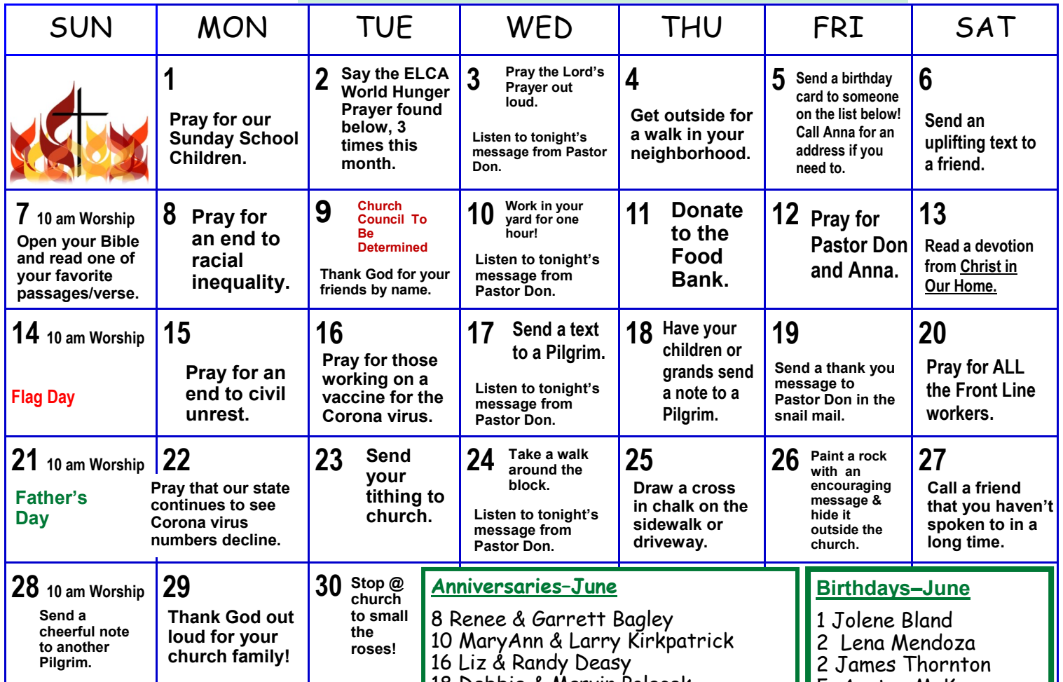
Table Prayer from ELCA World Hunger

Come Lord Jesus, be our guest, And let these gifts to us be blessed. Blessed be God, who is our bread; May all the world be clothed and fed.