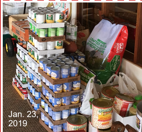
Jan. 23, 2019