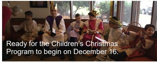
Ready for the Children's Christmas Program to begin on December 16.

Please join us in the Quilting Room off the kitchen for fellowship and Women's Bible Study on Saturday January 12 at 10 am. Copies of the study can be found on the desk in the Narthex.