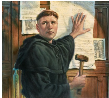
The posting of the 95 Theses by Martin Luther in October 1517.

Planning is in full swing by the committee for a splendid day of fellowship on October 29, beginning with worship at 10 am. Choir will be singing during the worship. An Oktoberfest meal, complete with a root beer garden, will be served after worship. Then we will have a hymn sing prior to viewing Rick Steve's PBS Special "Luther and the Reformation" at 1 pm, and the festivities will conclude with a prayer service at 2 pm. The community is invited and welcome, so gather your neighbors and come to the party.