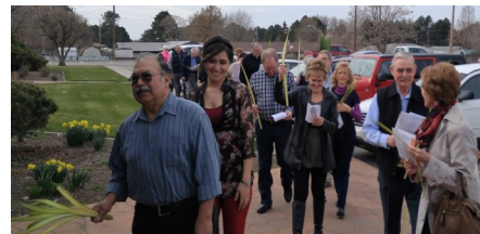
Palm Sunday Procession