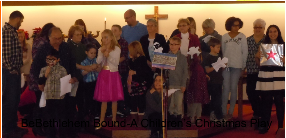
Bethlehem Bound-A Children's Christmas Play

All are welcome to attend, but only "voting members" may vote on motions. Thank you for your continued support of Pilgrim Lutheran's mission. We look forward to seeing you there!